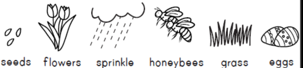
seeds flowers sprinkle honeybees grass eggs

z e w r d w f c g s p r i n k l e r s d w s s o o o a b a k e s h w w s h o n e y b e e s z g q d a j r r g e g g s k g s s i