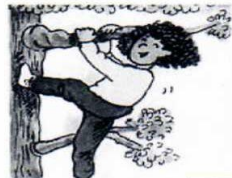
Climb a tree