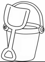
BUCKET AND SHOVEL