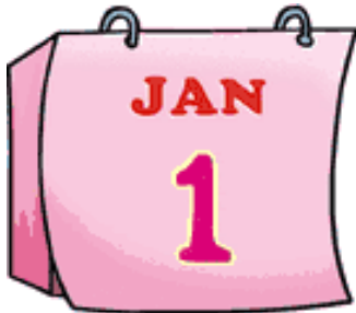
NEW YEAR'S DAY