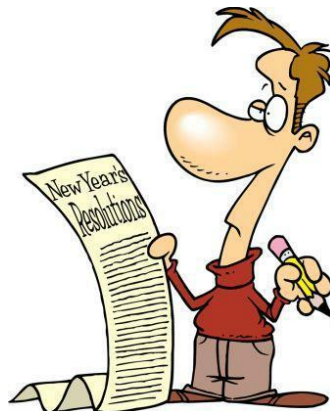
NEW YEAR'S RESOLUTIONS