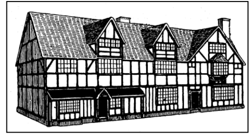
Shakespeare's birth place

William Shakespeare is England most famous writer and poet. He is born in a small town, Stratford-upon-Avon, on April 23 rd , in 1564 the third of eight children. His father is a merchant. He starts school in Stratford