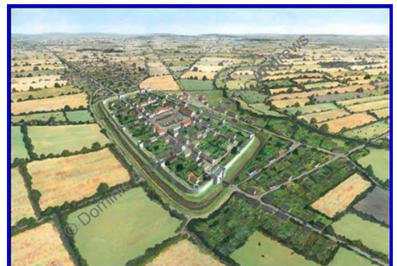
The walled Roman city of Dorechester

Roman camp. The most famous Roman cities are: