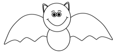
BAT _____ _____