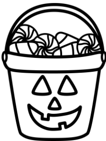
TRICK OR TREAT BAG _____ _____