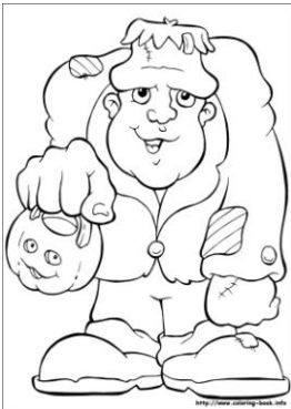
MONSTER _____ _____