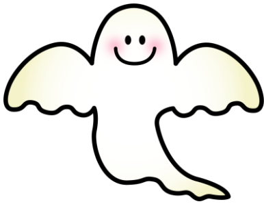
GHOST _____ _____