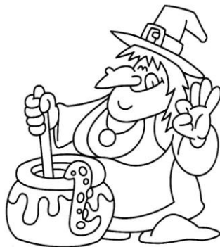
WITCH _____ _____