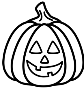
JACK O' LANTERN _____ _____