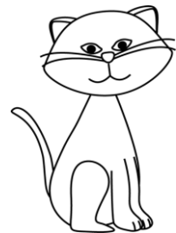
BLACK CAT _____ _____

COLOUR THE PICTURES: the sweets are orange, green and purple the witch is purple and green the cat is black the bat is black the pumpkin is orange the monster is purple, green and brown the ghost is yellow the jack o' lantern is orange and yellow the trick or treat bag is orange