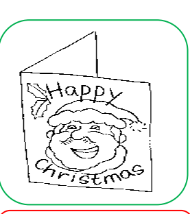
CANDY CANE CARD