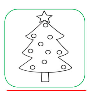
CHRISTMAS TREE STAR