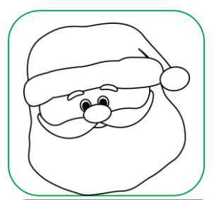
SANTA CLAUS REINDEER