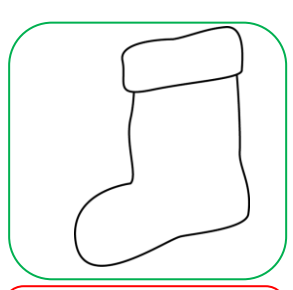
CANDY CANE STOCKING