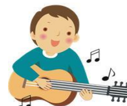
PLAY THE GUITAR